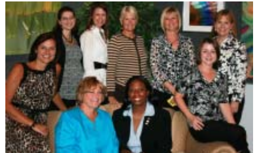
Past and current presidents pose for a presidential picture!

The comments were excellent, and the attendees enjoyed hearing about how it all came together. A big PR Thank You to all that participated!