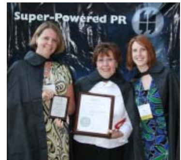
The Lee County Port Authority team really got into the act with masks and capes emblazoned with "airPoRt."