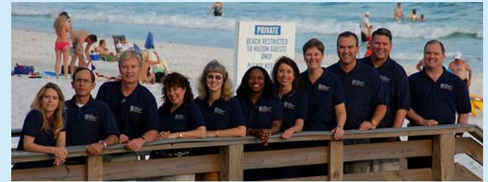
The FPRA Executive Committee members pose on a boardwalk to the beach.